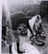
Family members of a miner who died in the tragedy.

There was an eerie calm at Kalikapur with villagers hesitant to talk to outsiders. On Sunday afternoon when The Hindu visited the place most of the locals refused speak about the accident and those who spoke refused to share their names fearing reper-